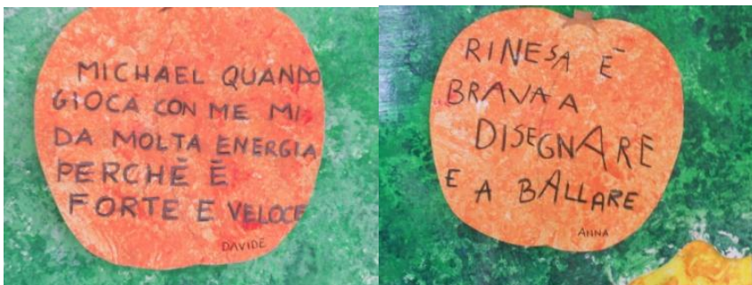
Details of a Tree of Talents (Treviso, 2011/2012)