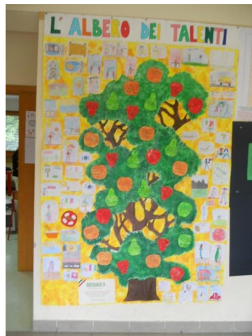
An overview of Trees of Talents (Treviso, 2011/2012)